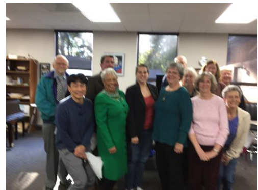
Those who attended 2018 Church Conference:

Copies of the Church Conference reports are available in the church.