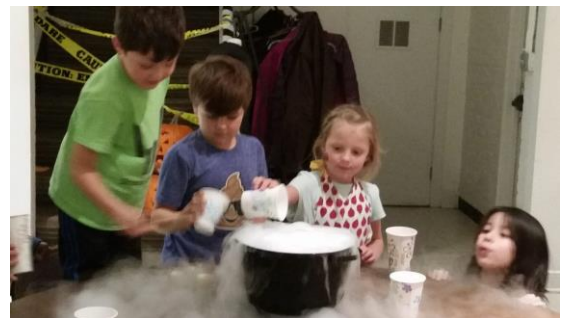
An interesting science project "Making witches brew"